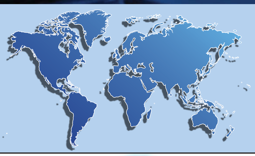
For a complete listing of all representatives, please visit our website at www.micropoise.com