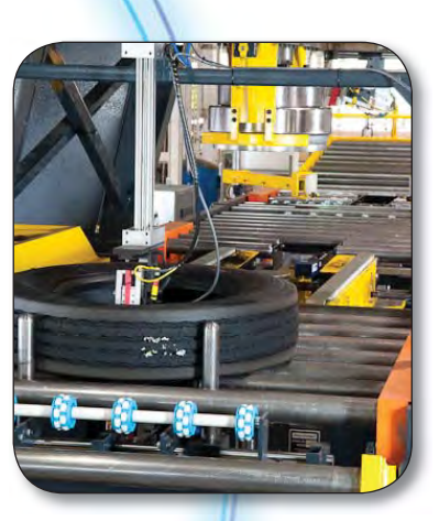
Optional Marking System

Layout shows FD90 with entrance and exit lift gates. This illustration also shows the optional Rim Assist Mechanism in front of the testing station. Also shown is the optional TGIS-SLT™ and exit station markers.