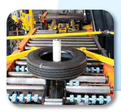
Tire Centering and Lubing Station