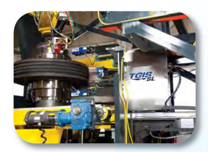
Optional Tire Geometry Inspection System TGIS-SLT™