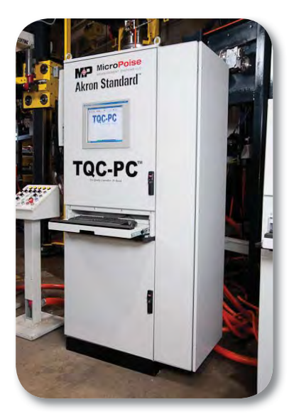
MS Windows® Based TQC-PC™ Computer System